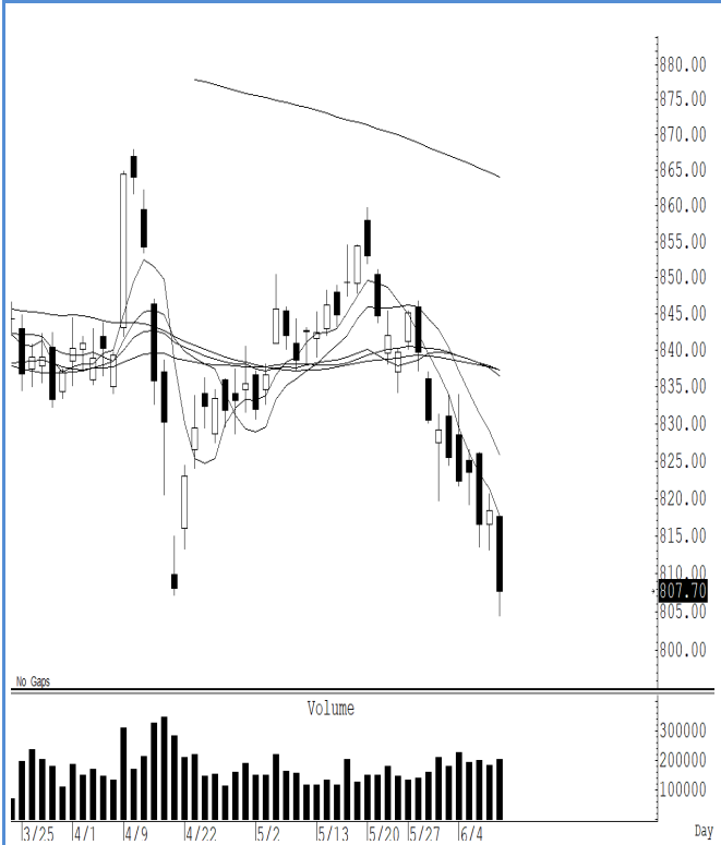
S50M24 (Close 807.70 Chg -10.70)